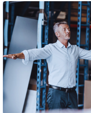
How to Squeeze Mindfulness Into Your Day