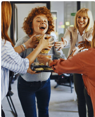
Schedule Recovery Time for Your Team

Log in and explore the Reach Well-being Program to expand your self-care knowledge and practice new habits. The Self-care Spotlight activities will be available through March 2023 and new activities & challenges will be added throughout the year.